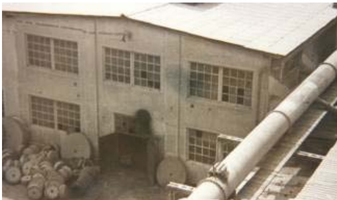
Factory in 1951