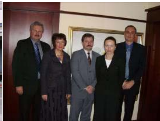
Co-workers from Unior Coframa z.o.o.