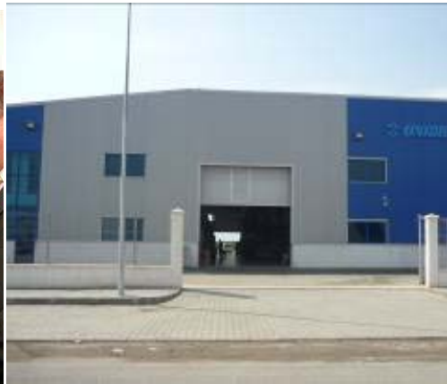
UNIOR TEPID S.R.L.