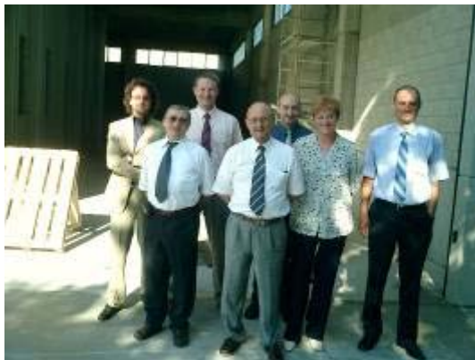
Co-workers from UNIOR Italia