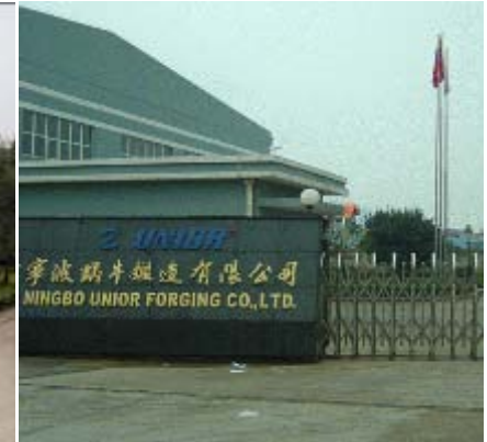
Zlati grič d.o.o Unior Australia Tools Company Unior Components d.o.o. Ningbo Unior Forgings