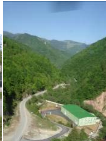
Unior Aqua d.o.o.