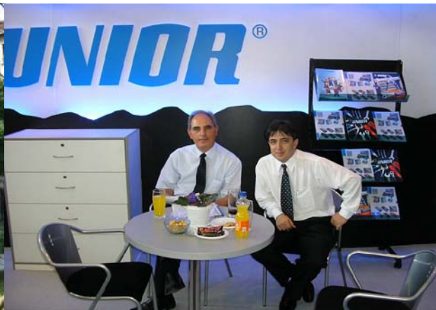
Co-workers from Unior Bulgaria Ltd.