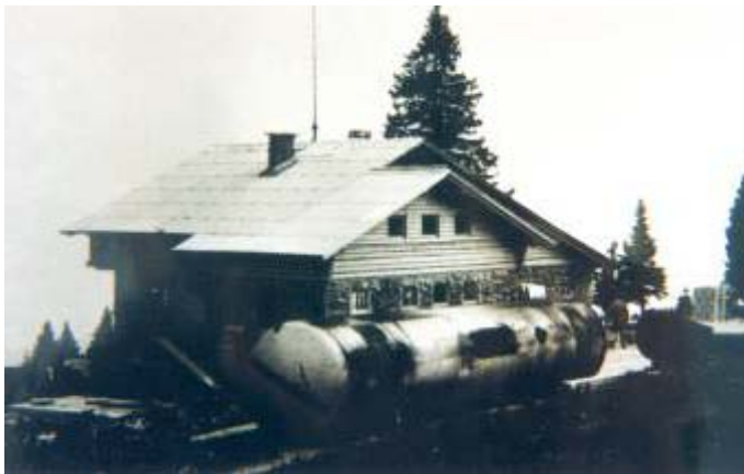
Cottage on Rogla