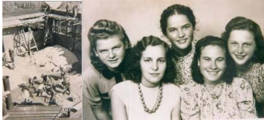
Officials during the War