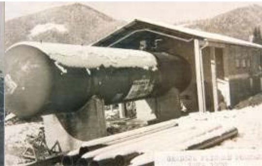
Gas Facility Construction in 1973