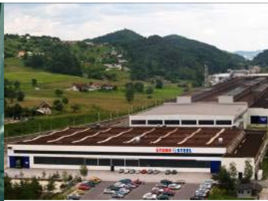
Štore Steel d.o.o.