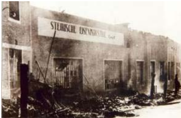
The Site of the Fire