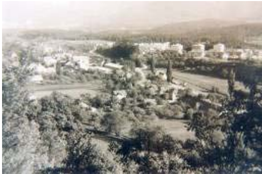
Factory in 1973