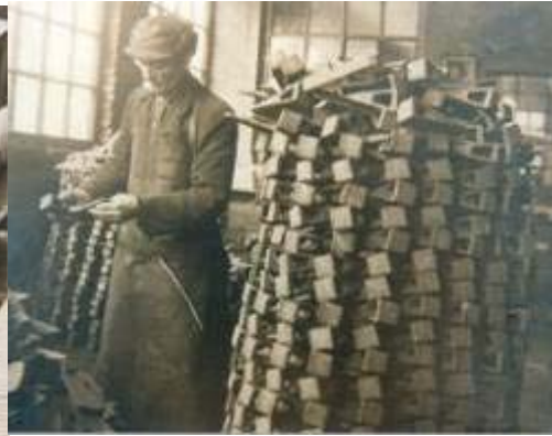
Interphase Axe Control