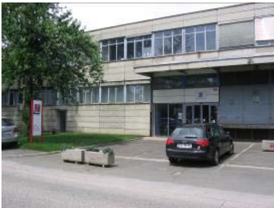
Weba Maribor d.o.o.