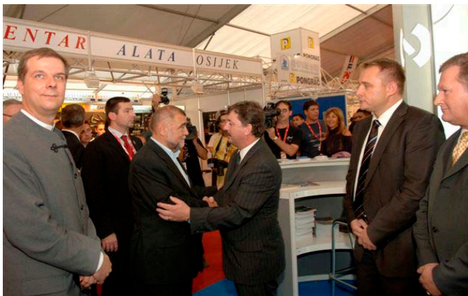
President Mesič visited UNIOR's showroom