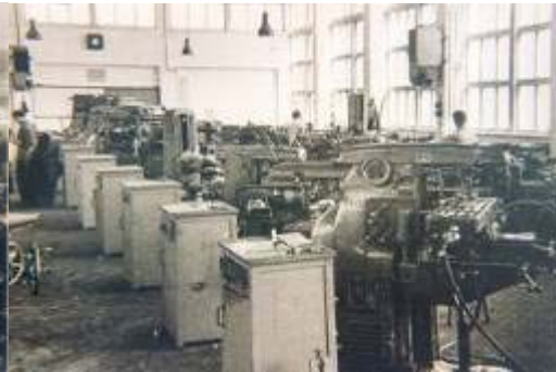
The Processing Plant in 1971